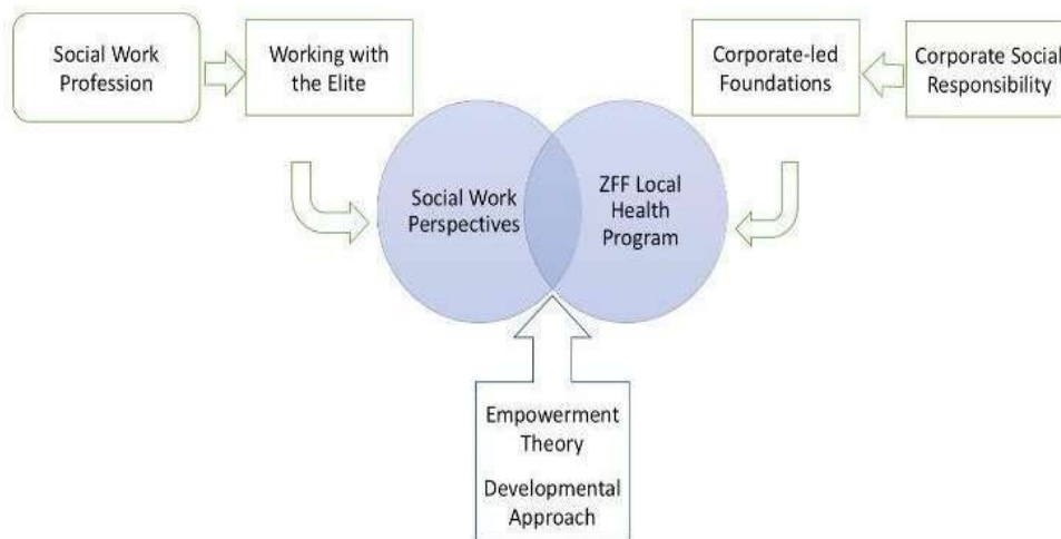
Figure 1. Conceptual framework

The framework to be discussed will show the relationship between the variables of the study.